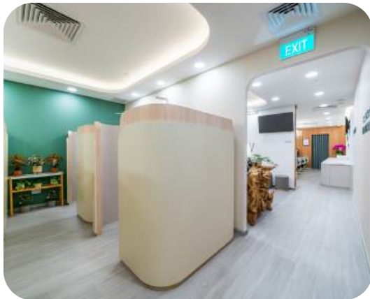
WAITING AREA - TAMPINES

Discover unforgettable fragrances in our catalog, crafted to express elegance, confidence, and timeless charm