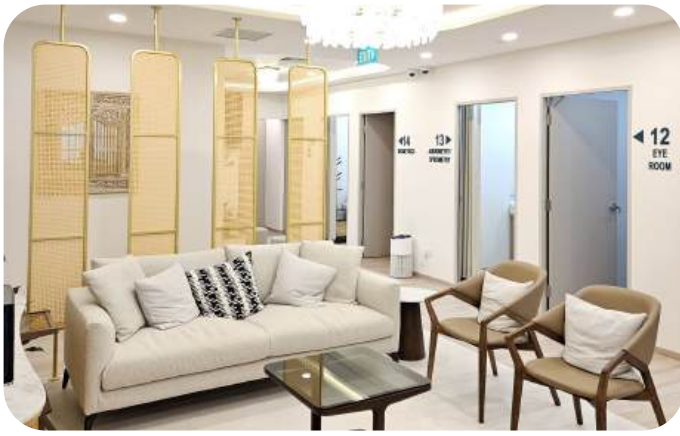
WAITING AREA - ORCHARD