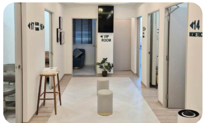
CLINICAL TEST AREA - ORCHARD