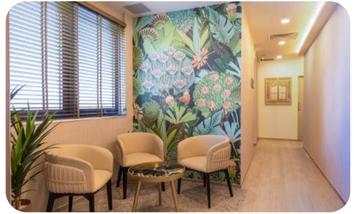
WAITING AREA - ORCHARD