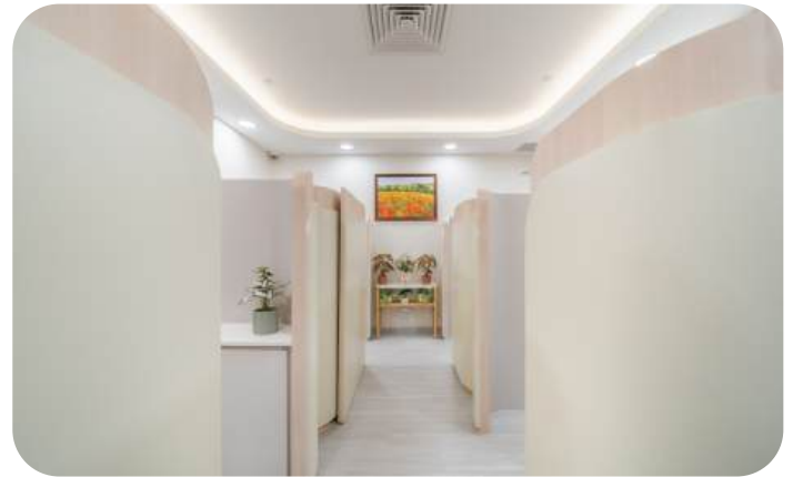
BLOOD TAKING PODS - TAMPINES

Discover unforgettable fragrances in our catalog, crafted to express elegance, confidence, and timeless charm