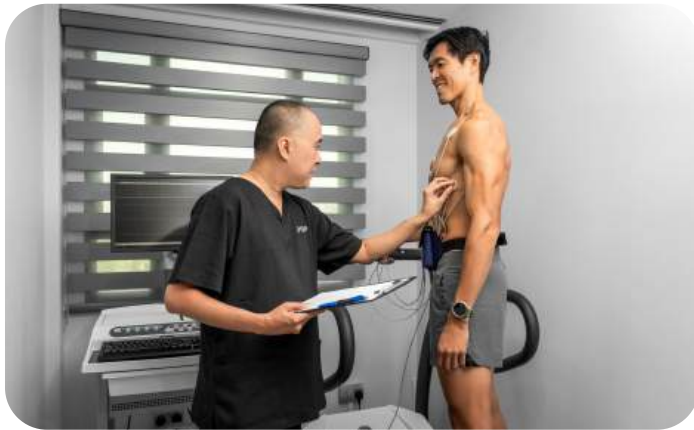
TREADMILL STRESS TEST